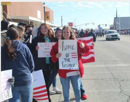
9th-12th Grade at the Veteran's Day Parade