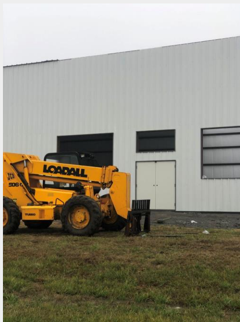
The New Bradford Building

Since last quarter, a lot has happened with the new building. Mr. Stamper stated, "They finished the door's framing and are stretching bands in the rafters to hold the insulation in the ceiling. We are hopeful that we will finish the east side and the roof. After the insulation is fully put on and secure, they will start working on the interior."