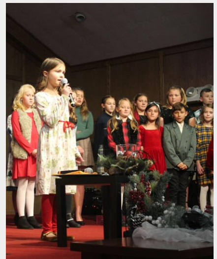
3rd-6th Grade Classes at the Program