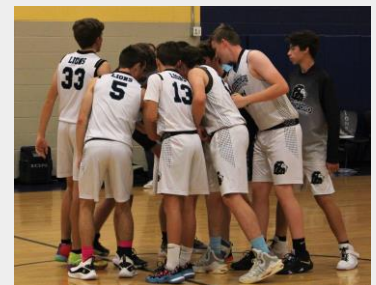
The Boys Varsity Team

Check our website for upcoming elementary and varsity games!