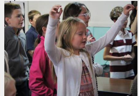
The 3rd-6th Grade Chapel

Occasionally, the high school building will have a student-led service on Wednesday. This gives students the opportunity to preach, or listen to their friends speak the gospel. Lately, students have participated more in the weekly worship with singing and preaching. It has been amazing to watch and listen to everyone that participates in chapel.