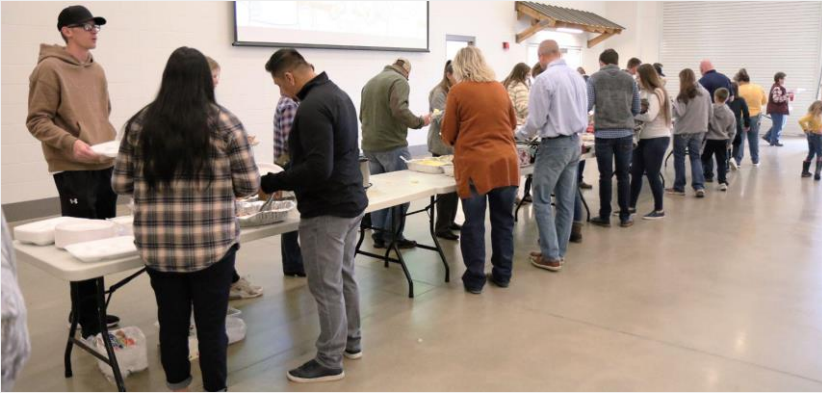
Bradford Family Enjoying the Thanksgiving feast