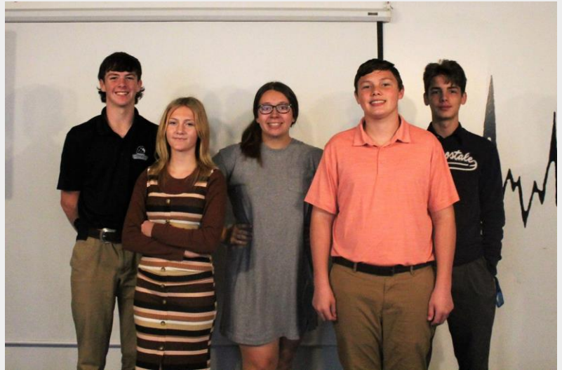
The Winning Blue and Gold Team