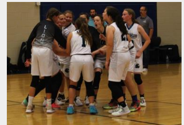
The Girls Varsity Team