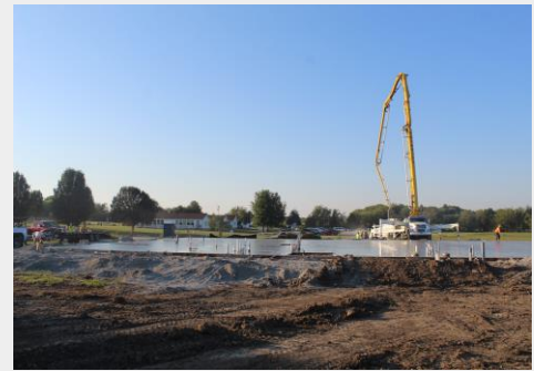
On September 16 cement was poured. Photo by Caleb Henington (10)

As the new 5,000 square foot building is going up, students and teachers have been awaiting the upcoming opportunities that will be made available. “The new building is anticipated to be completed and ready for use by June of next year. It will have two stories, an elevator, a gymnasium, classrooms, offices, dressing rooms, and a cafe.”