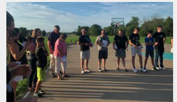
The final prayer was on the court